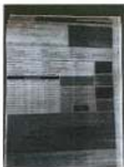
College Electric Bill.jpg 144K

PRINCIPAL MET's School of Architecture and Interior Design, At Govardhan, Tal. & Dist. Nashik - 422 222.