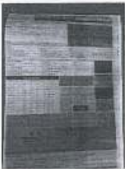
College Electric Bill.jpg 144K