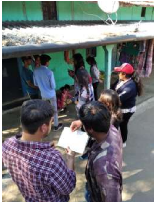
Students are taking measurements and making drawings