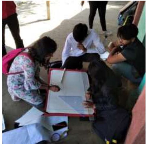
Students are taking measurements and making drawings