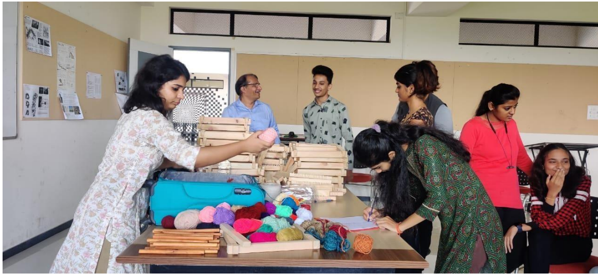
Demonstration by Artist