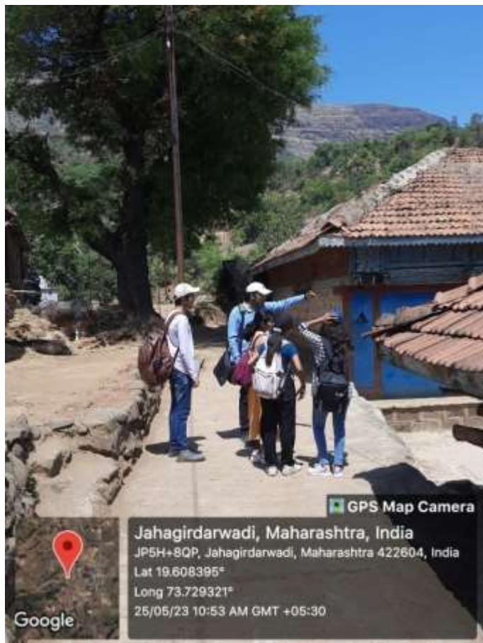
Faculty giving Instructions to students