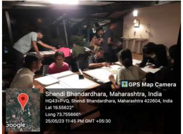
Students Working at Hotel after documenting the village